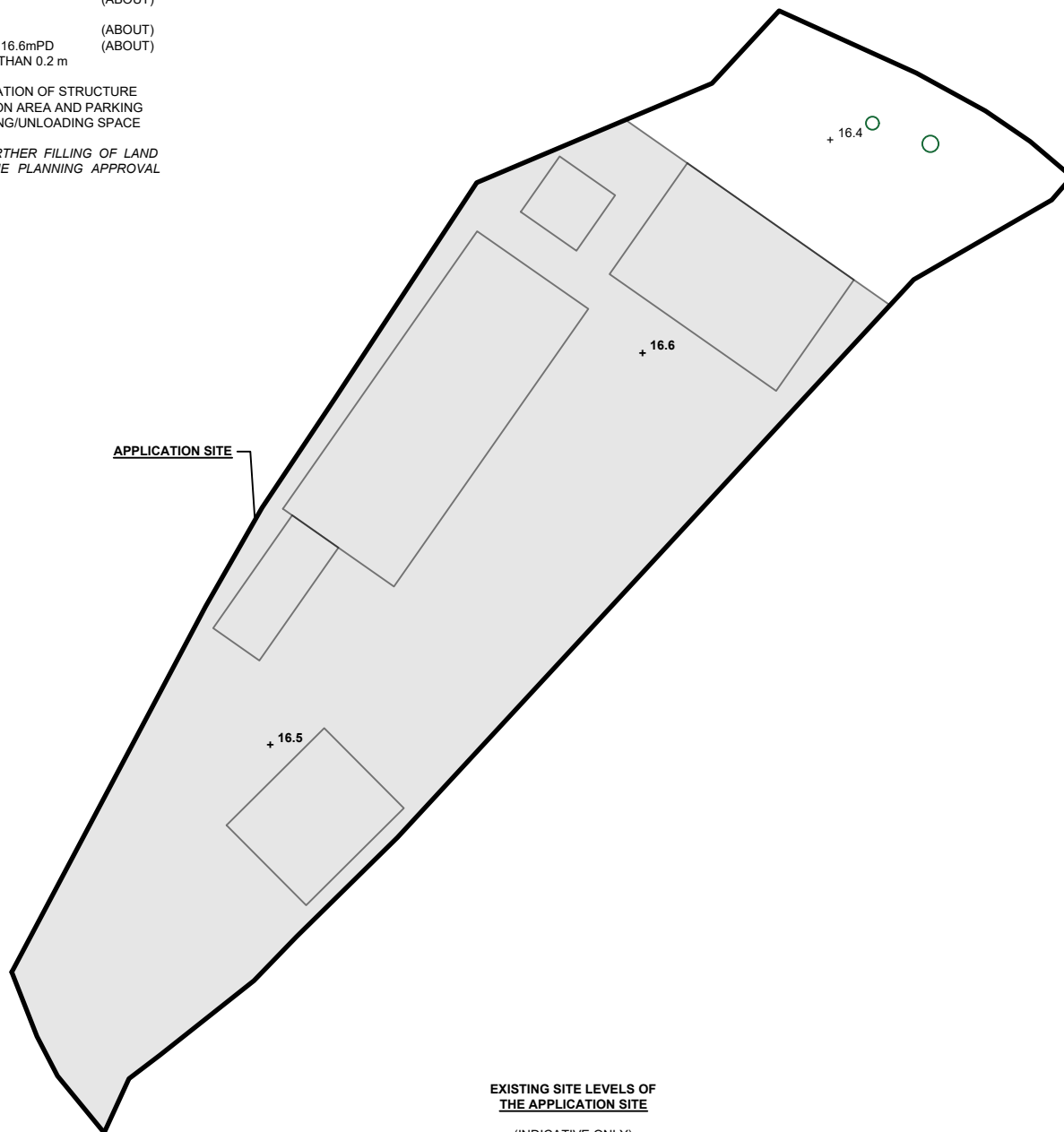
EXISTING SITE LEVELS OF THE APPLICATION SITE (INDICATIVE ONLY)

THE APPLICATION SITE HAS BEEN FILLED, NO FURTHER FILLING OF LAND WILL BE CARRIED OUT AT THE SITE DURING THE PLANNING APPROVAL PERIOD.